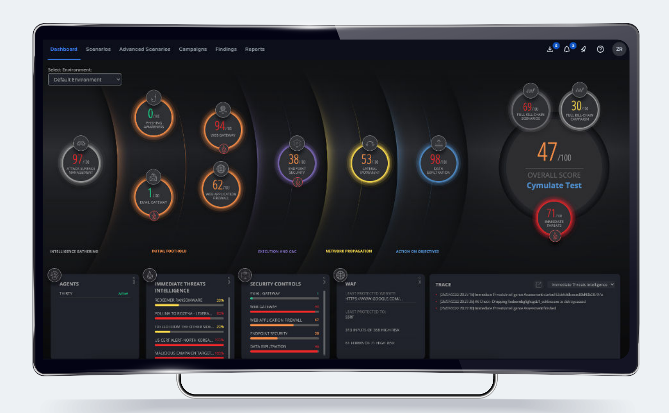
Figure 1 – Testing controls across the full kill-chain

Ideally, simulations should utilize real-world APT tactics used by well-known APT groups. For example, groups like Fancy Bear, OilRig, Lazarus Group, Ocean Lotus, and Dragonfly 2.0 have characteristic modus operandi. The simulation tool should also automatically update their simulations to emulate the latest threat trends and tactics.